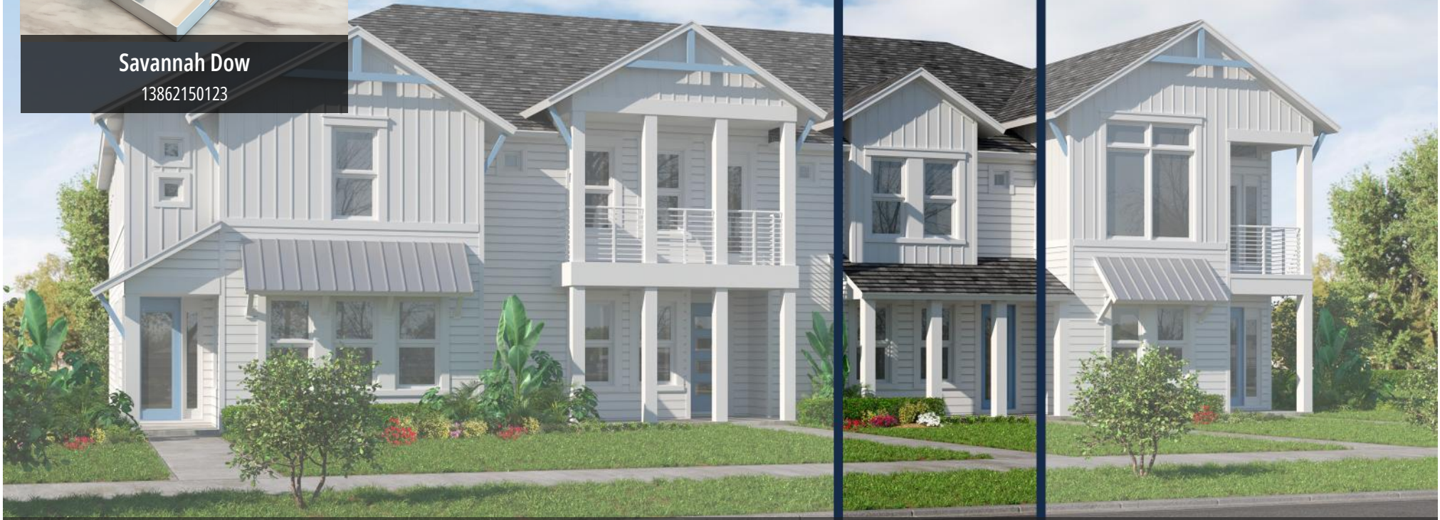
THE DELEON - D at NOCATEE