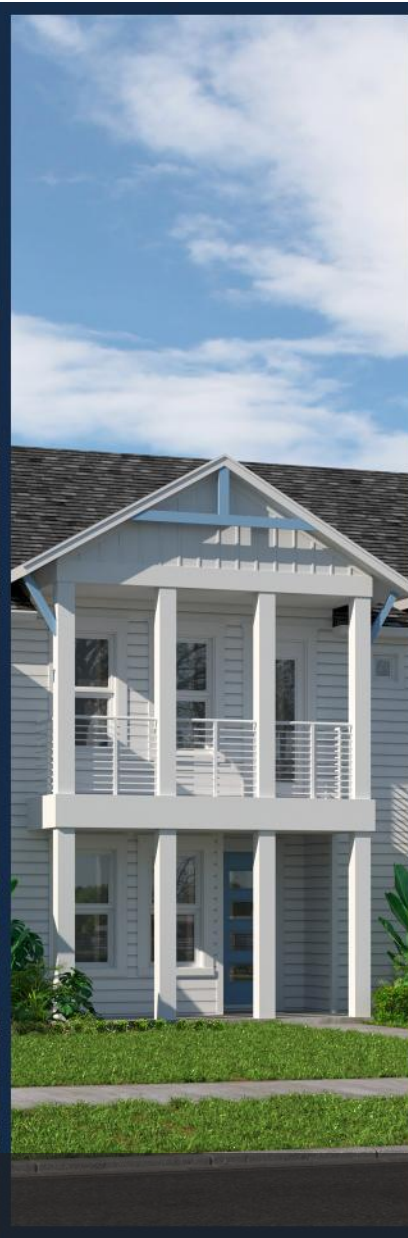
THE CASTILLO - FARMHOUSE