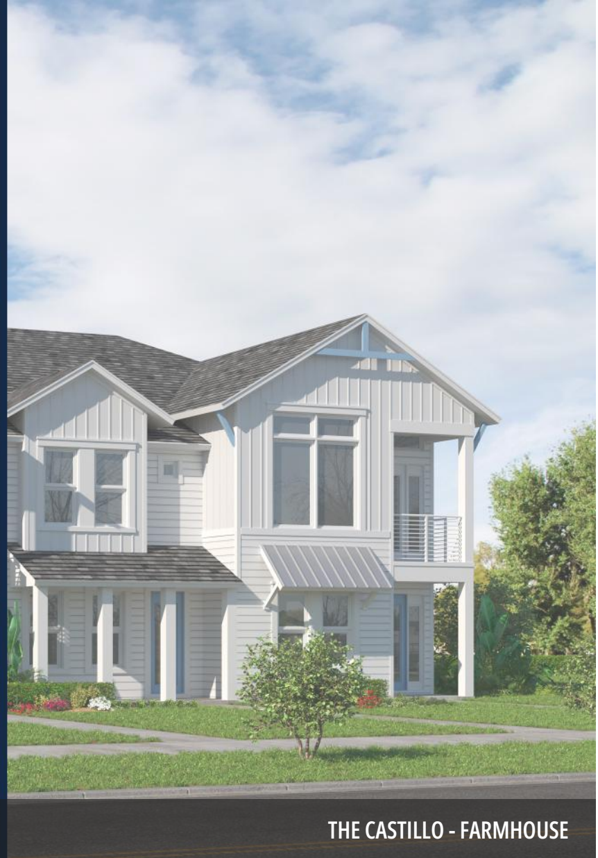
THE CASTILLO - FARMHOUSE